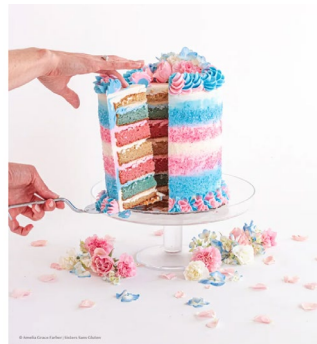
Gluten Free Lavender Vanilla Trans Pride Layer Cake

One cake-baking website boasts, “[t]he great thing about baking . . . is that it can carry messages . . . . This cake is another one of those chances: Trans rights are human rights[.]” Gluten Free Vanilla Lavender Trans Pride Layer Cake , SISTERS SAN GLUTEN (Sept. 18, 2020) 13 (emphasis added).